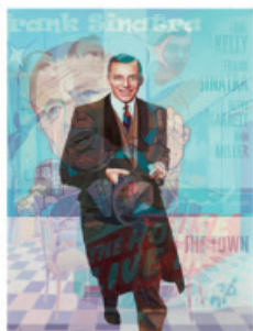
Frank Sinatra: Man About Town