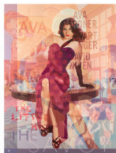
Ava Gardner: A Desirable Proposition