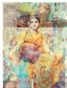
Maria Callas: A Moment of Respite