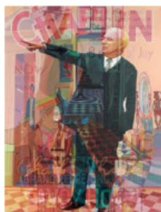
Charlie Chaplin: Silent Path to Success