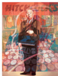
Alfred Hitchcock: The Mysterious Thinker