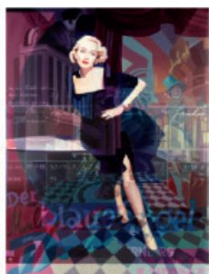
Marlene Dietrich: Into My World