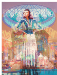
Katharine Hepburn: Taking Centre Stage

Each painting features a star of the stage or screen who enjoyed staying here at The Savoy.